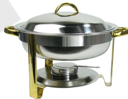
Deluxe Round 4qt