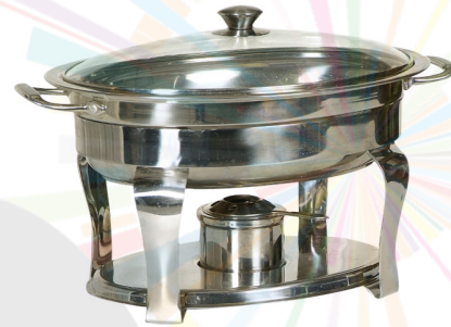
Tramontina Oval 4qt

Before returning chafing dish, scrape and empty any leftover food residue. Please do not wash, Expo always does the washing!